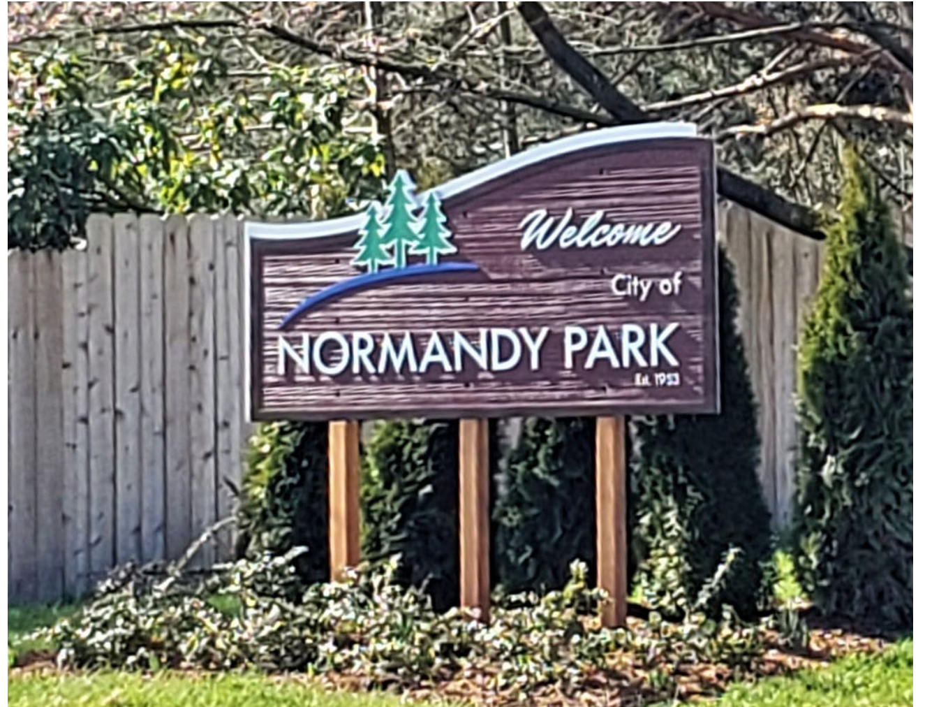
Welcome to Normandy Park, ca. Unk.