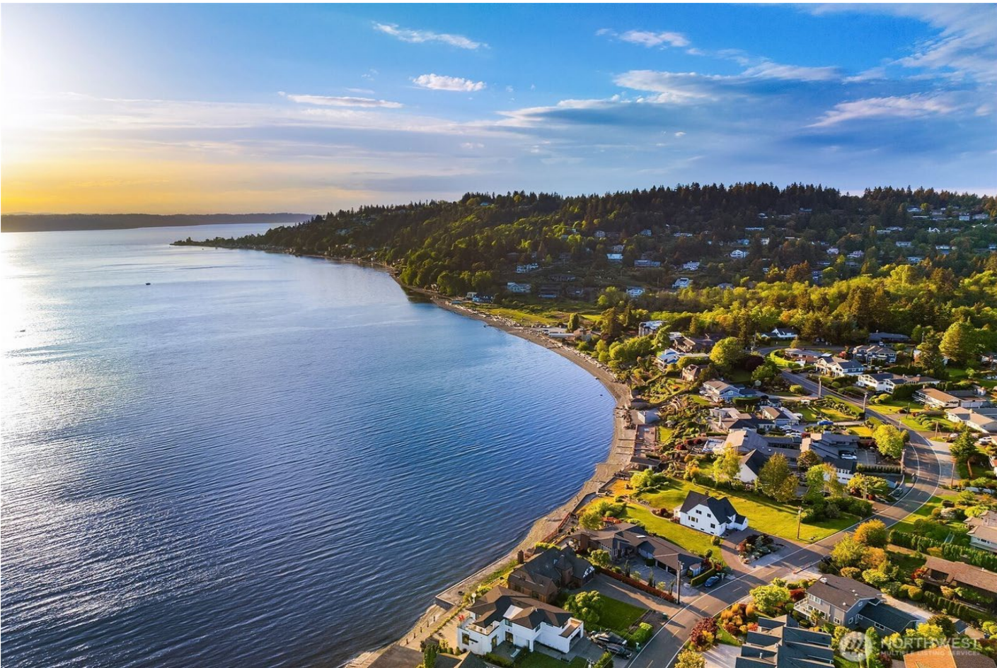
Normandy Park, ca. Unk.