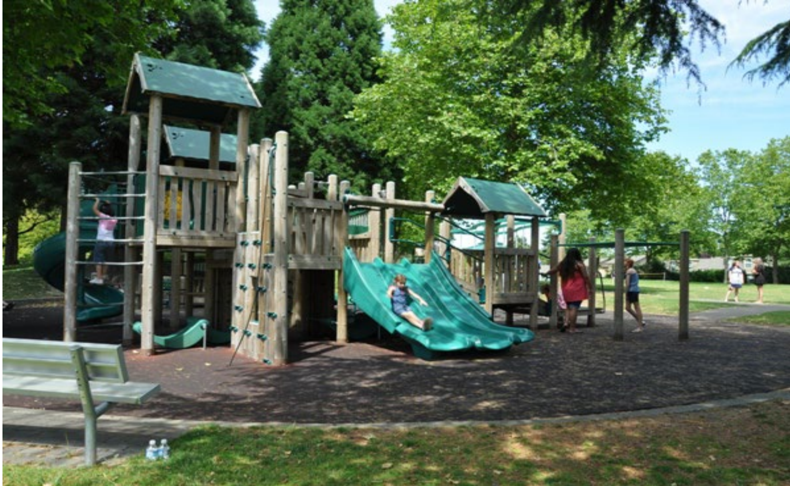
Marvista Park Playground Normandy Park, WA, ca. Unk.