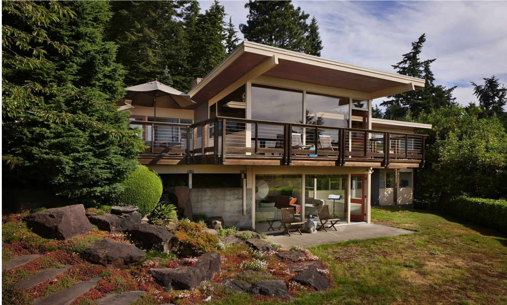
Home Designed by Benjamin McAdoo, Normandy Park, WA ca. 2022. Photo courtesy Seattle Times/Benjamin Benschneider/Sherri Olson Architecture